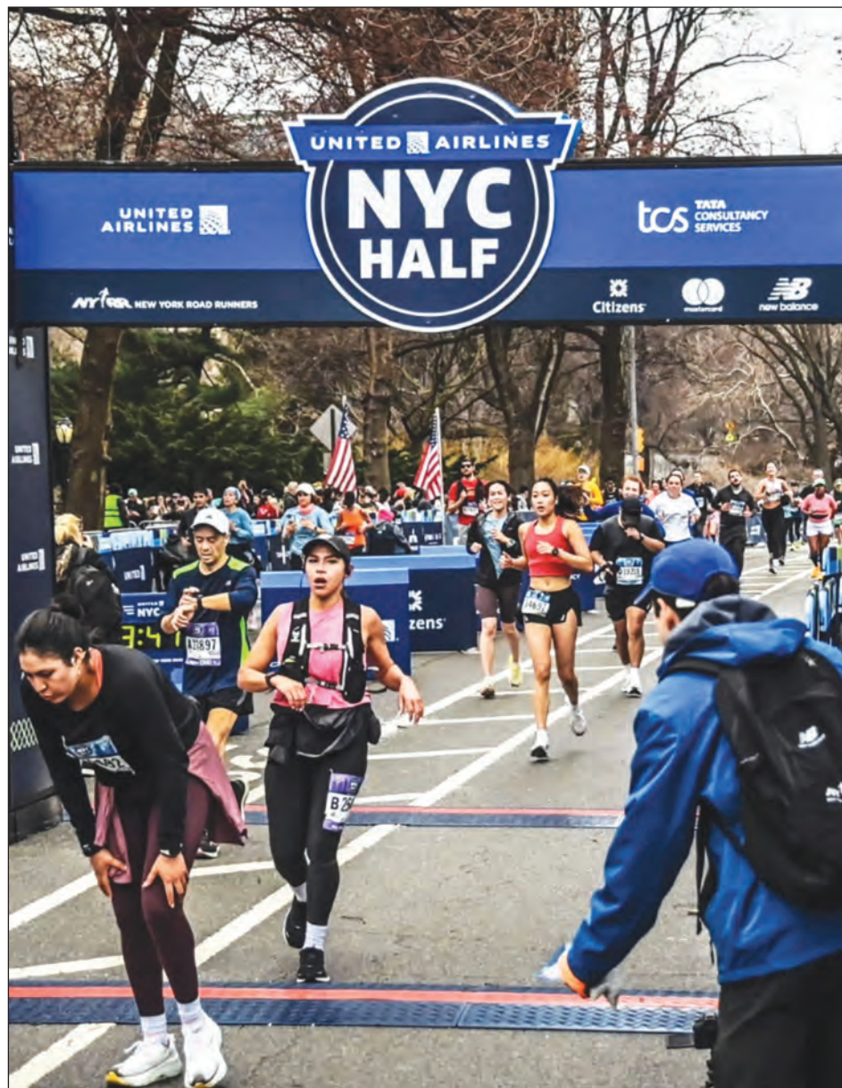
Runners crossing the finish line in Central Park.