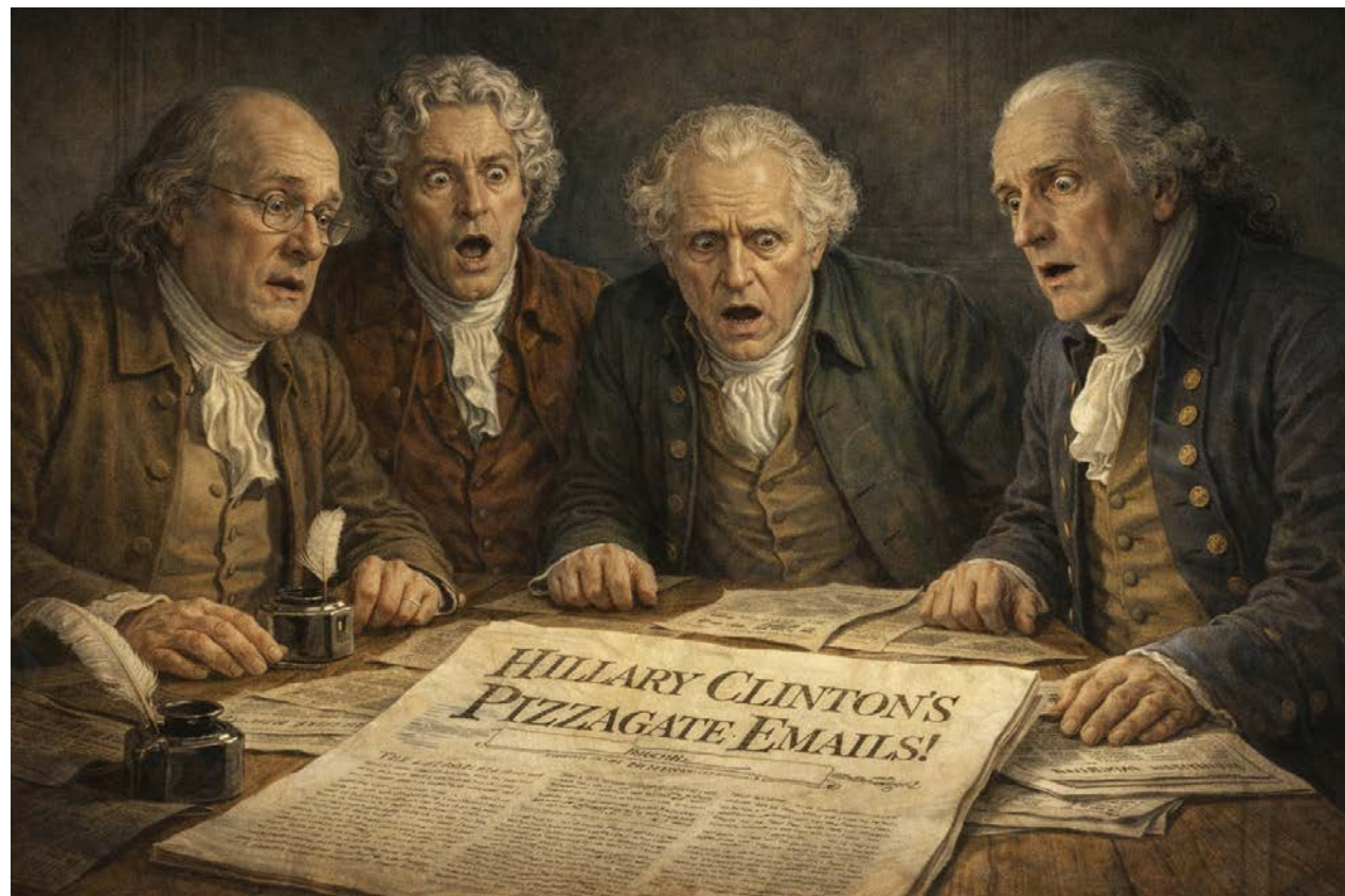
Image generated using ChatGPT.

It's whether a democracy designed for pamphlets can survive algorithms.