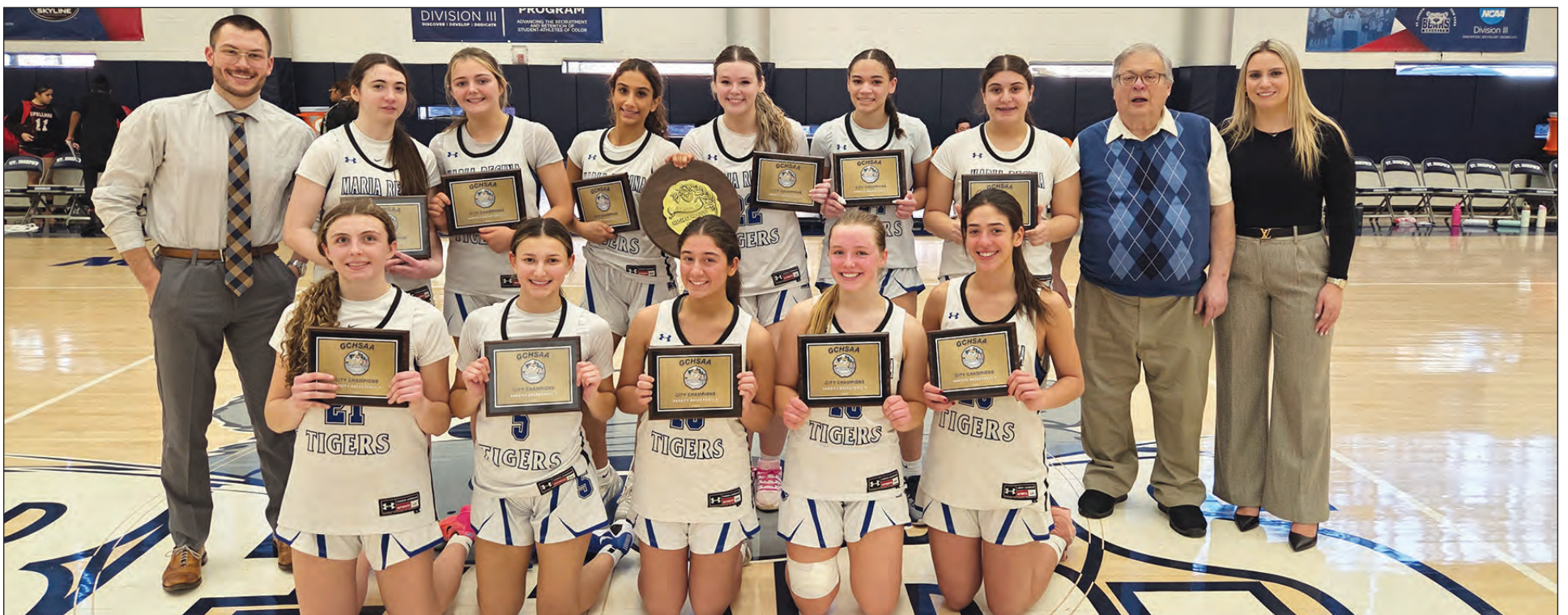
The Maria Regina Tigers won the CHSAA City Championship Division A title by beating Cardinal Spellman on March 1 at St. Joseph's University.