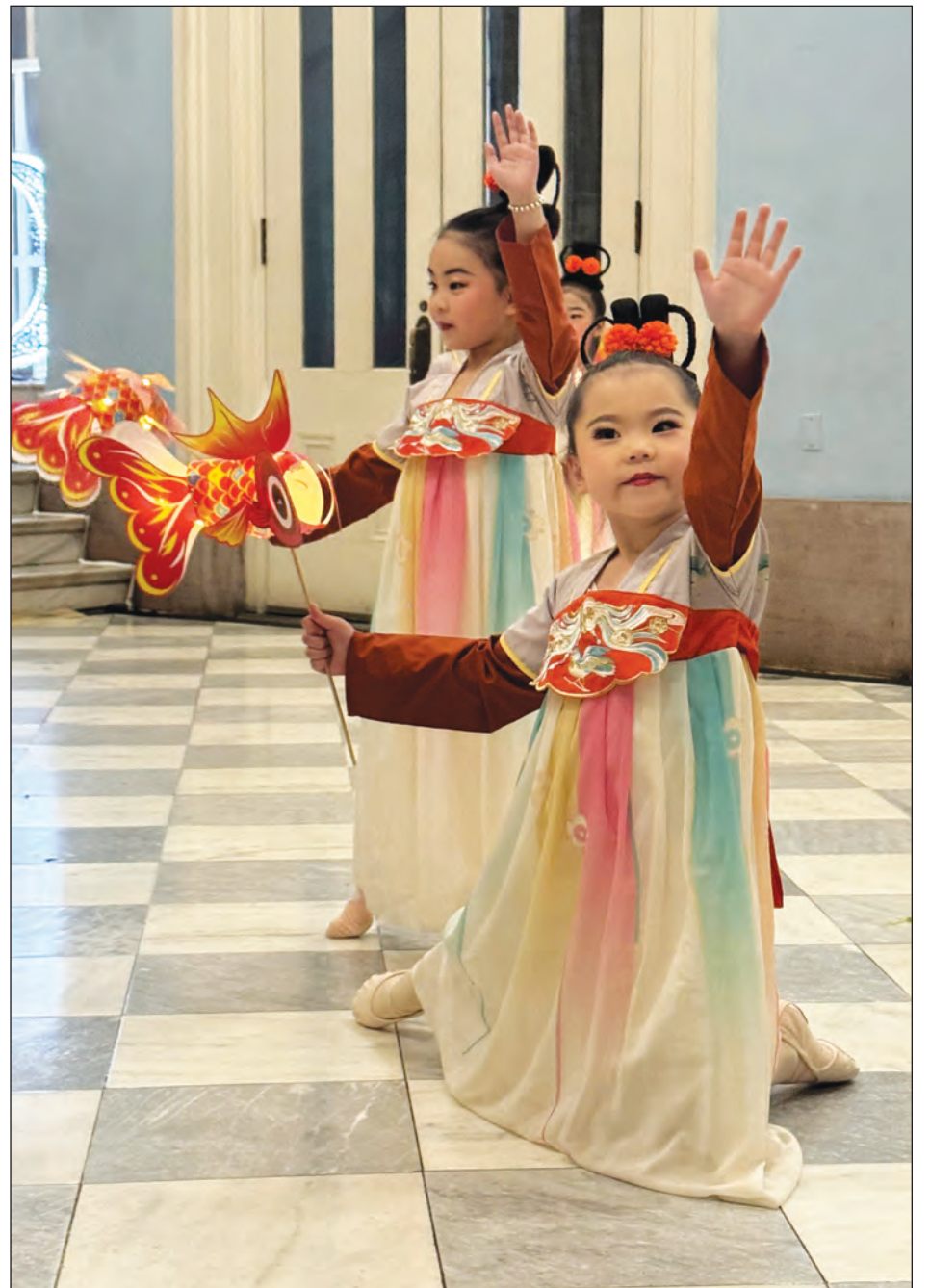
Kids performed at Brooklyn Borough Hall for the annual Lunar New Year celebration.