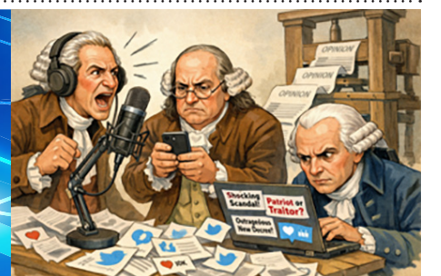
Image generated using Sora.

Tech on Deck: Artificial Intelligence Back to the Past: When Media Was All Opinion, All the Time