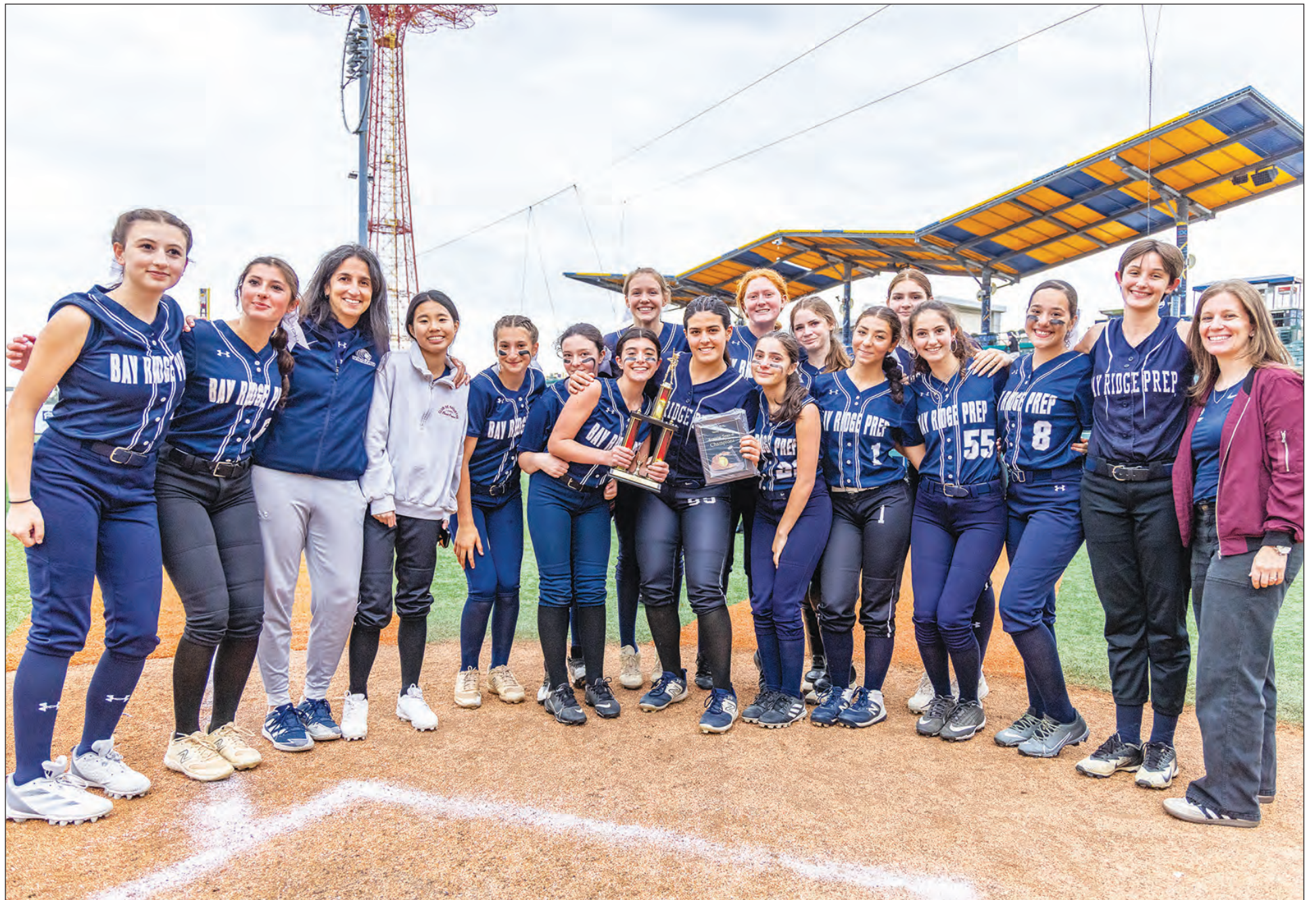
The Bay Ridge Prep softball team has high hopes for the 2026 campaign.