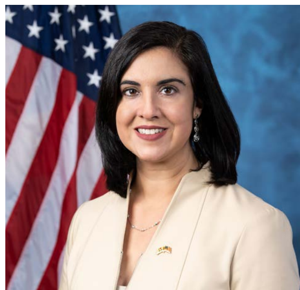
Congresswoman Nicole Malliotakis, NY-11.

In a first of its kind, we created a newborn baby investment account featuring a $1,000 contribution for every American child born after Jan. 1, 2025. The account is fully in the child's name, and the