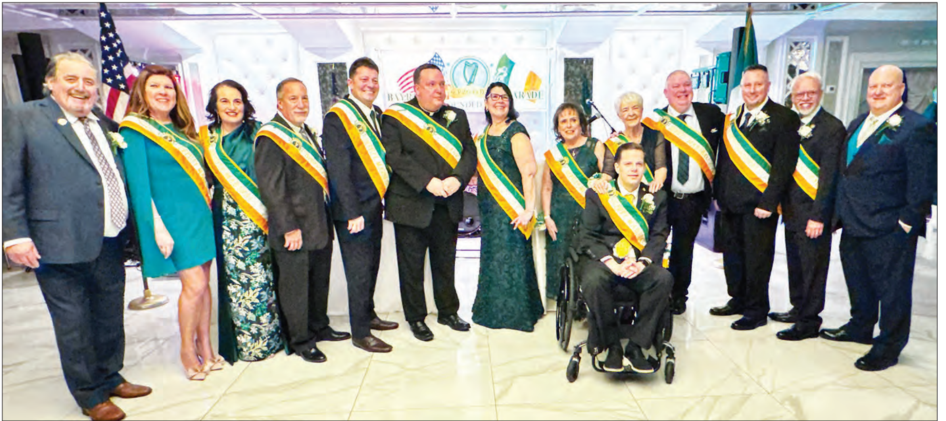
This year's Bay Ridge St. Patrick's Day Parade honorees.